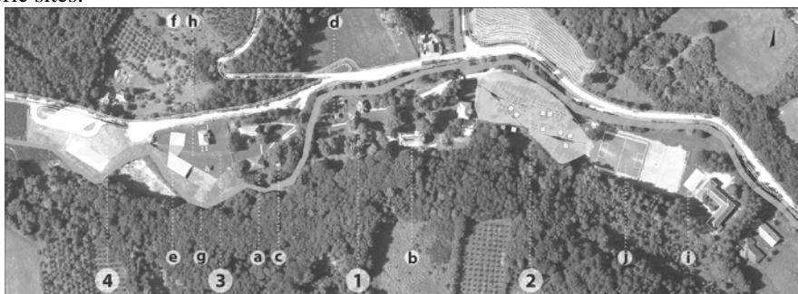
Figure 1. Programmatic urban planning solutions for the Brankovina historic landmark – the existing situation (1) and the planned situation (2) (3) and (4)

The other site to be developed includes a village community centre (Fig.2), planned as an ethno-park with cultural and educational, tourism and sports recreational contents and hospitality facilities. The complex is designed so as to become an unavoidable one-stop shop for nearby tourist tours with the aim to present the culture of western Serbia. The programmatic urban planning solutions contain: visitor centre (1); hospitality facilities (2); the planned artificial lake - the new acquatorium (3); accommodation capacities of pavilion type (as traditional vajats ) envisaged for organizing the art colonies and accommodation of tourists (4); selling/exhibiting showroom for works of art, handicrafts and souvenirs created in art colonies (5). A special functional entity within the centre includes: recreational sports contents with grounds for the so-called "small sports" (6). In addition to a system of pedestrian paths and biking trails, the covered sitting areas (7), amphitheatre/moveable