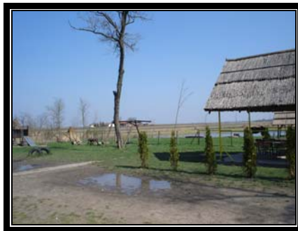
Fig. 3: School in the Nature- Ludaš Lake

somebody who works in the field doesn't have a time to read newspapers every day or to do it in details. Radio, local televisions should be a part and co-operant in the process of implementing an idea of Learning Region.