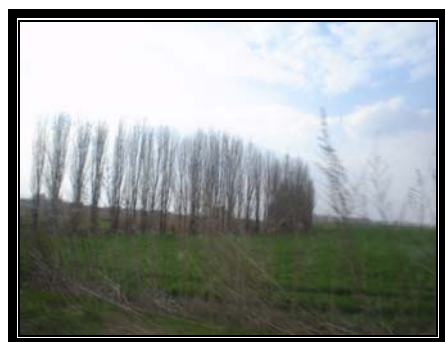
Fig. 1: Agricultural Landscape

The other kind of soil widely spread in this area is salty soil. This is the soil with higher percentage of sand than usual. Origin of the sand in the soil is Southeastern part of Vojvodina from where winds brought it during a long geological period. Sandy soil is convenient for grape and fruit growing and some parts of Municipality are also well known as vine and fruit producers, not only as part of tradition, but for industrial need too.