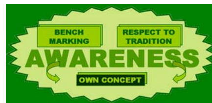
Fig. 4: Steps in the Future

suggestions from the partner countries or from the experts or even laic opinions in Serbia takes appropriate place in the future. Each suggestion doesn't have to be implemented and taken without consideration of consequences but can be an inspiration and a push to some new, good ideas which are seriously acceptable.