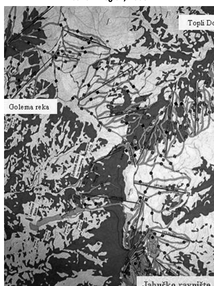
Fig. 2. Solution for the Jabučko Ravnište ski and tourist resort according to the Master Plan