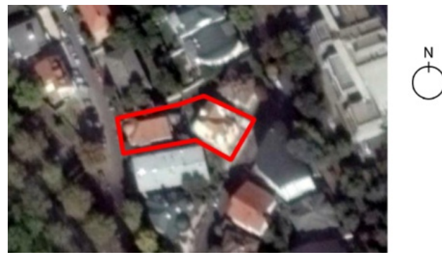
Figure 1: Site plan of the buildings

The healthcare facility is made up of two buildings (one new and one old). The old building has a ground floor, two upper floors and a gallery, while the new building has three lower floors, a ground floor and two upper floors, with a total gross building area of 2042 m<sup>2</sup>. The Healthcare building 1 is older, and it has all technical documentation regarding its present state, while the Healthcare building 2 is newer and has a complete project documentation. The ground floor of the Building one becomes floor 2 in the Building 2 and they act as one area in the healthcare center. The capacity of the healthcare facility is 8 apartments (around 20 beds/patients) (Fig. 1, 2).