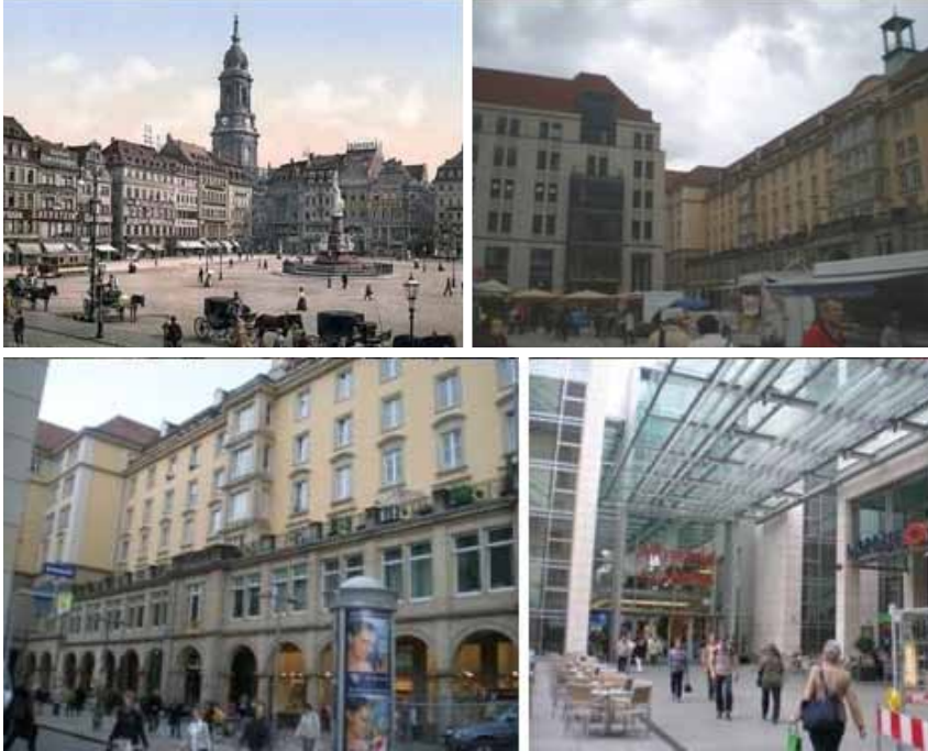
Figure 7. Dresden: Altmarkt square, the former appearance, before II WW, (top left) and its present form with facade of the Trade Center Gallery, 2009 (right and bottom).

m 2 on 2.5 hectares of surface. Altmarkt square now has a final form, resembles the former one, as much as it is possible, by its architectural style, regulation, and land use.