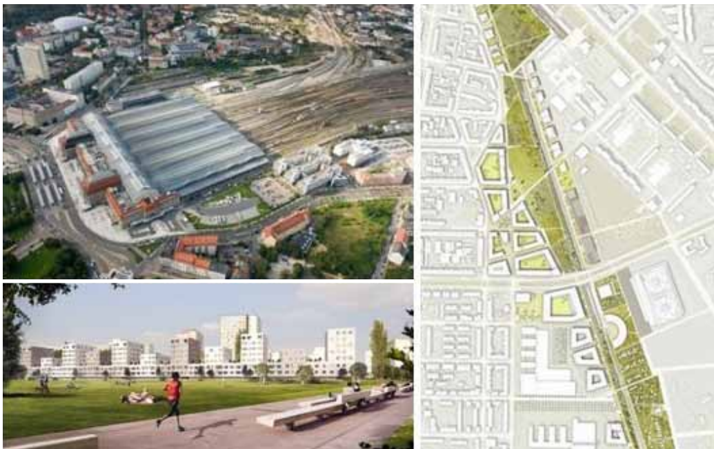
Figure 3. Railway Station Leipzig Hauptbahnhof (top left, source: www.bahnhof.de/bahnhof-de/Leipzig ), the first prize for recycling urban land of the railway station (right, bottom left; source: www.studiowessendorf.de/wessendorf/Stadtraum_Bayerischer_Bahnhof ).

Another example is the railway station, which is dating from 1915, with 24 tracks, functioning as a center for the intercity and international trains, serving as connection with the airport and part of the urban transport system. The station building itself, in addition to its basic functionality, orients towards the needs of all passengers and has a shopping mall on multiple floors. The building, and even more the rail tracks, occupy a huge space in the center of the city. Back in the late 19th century, professionals observed the need to put railway traffic underground and made plans to build a tunnel, but suspended the works for several times, due to historical events, so realization finally happened in 2013, by constructing of two underground platforms. The tunnel took over a part of the traffic, and through the process of reconstruction, a phase by phase, the plan is to reduce urban land occupied by tracks. This is a major investment in the infrastructure project, but with a higher goal. At the same time, in 2011, the city announced an international competition for urban renewal, reconstruction and landscape design of 40 hectares of ex rail land. 6 Urban recycling resulted in a new open public space, park, which lacked in central city zone and a supplement to the urban matrix with the new residential buildings (Fig. 3).