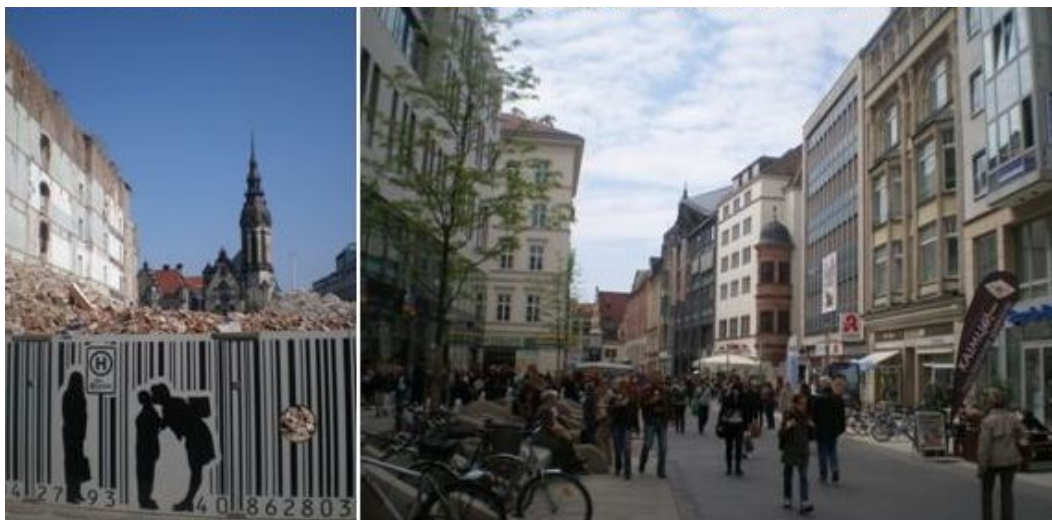
Figure 1. Leipzig: city in the process of renewal, pedestrian zone, 2010.

Insisting equally on the development of the commercial sector, which is in line with the tradition of the city, and public content in segments of culture and education gives results. Creative city scene (Zukin, 2004), a chance for the beginner's initiatives and the lifestyle of citizens, contributed a lot to the strategy "renew and continue what was started a long time ago" (Haase, et al, 2012). The last two and a half decades were dedicated to intense work on the restoration and protection of the cultural and historical heritage, 3 creating better housing conditions, urban compactness and recycling of unused or abandoned sites (Sawicka, 2017), the rebuilding of the cultural identity of the city, necessary changes in traffic networks and public transport, many infrastructure projects and shaping of public spaces (Neill, 2004), (Fig. 1).