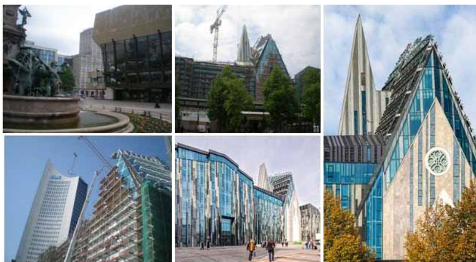
Fig. 2. Leipzig: Augustusplatz, Paulinum 2010-2017.