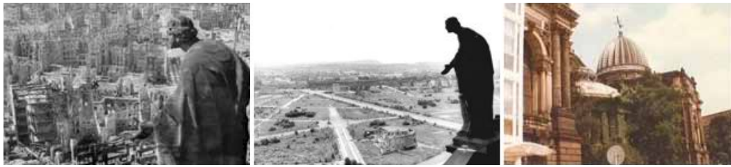
Figure 4. Dresden: the view of the center after the destruction in World War II in 1945 (left), removal of ruins, 1953 (center), the building of the Academy of fine arts in overgrown weeds, recorded 1991 (right).