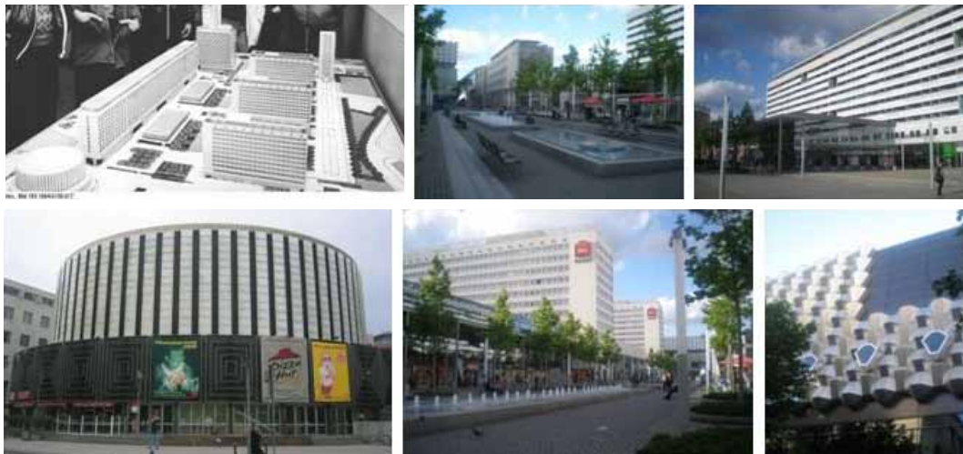
Figure 8. Dresden: Prager Street, model of the awarded design 1962 (top, left), Rundkino (below, left), appearance of the Prague street, 2009 (center and right).