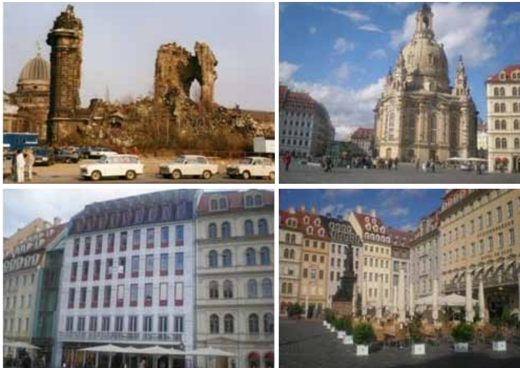
Figure 6. Dresden: Church of our Lady, post war situation (top left) and reconstructed church and square, 2009 (right and bottom).

the restored church along with necessary remodeling and fitting in. As a result, the difference in color is visible on the façades, which is also a unique testimony to history. Then followed an intense planning process to encompass the site of the Church and the overall appearance of the square. This was the first phase in the reconstruction of the square, that started the same year and consistently implemented block by block, building by building in the surrounding of the square, using interpolation of modern architecture where it was possible, but respecting the horizontal and vertical regulations, the subdivision of parcels and façade rhythm.