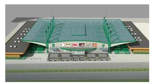
Figure 3. Roof of the Market in Block 44 in New Belgrade

The internal dimensions of the market are 65.52 x 47,72m. The inside roof is covered with Lexan panels installed on the central metal grid structure with dimensions 72.42 x 48.29m (Fig. 3). It is envisaged to install ASS on the flat roof of the building shaped like Cyrillic " \Pi ".