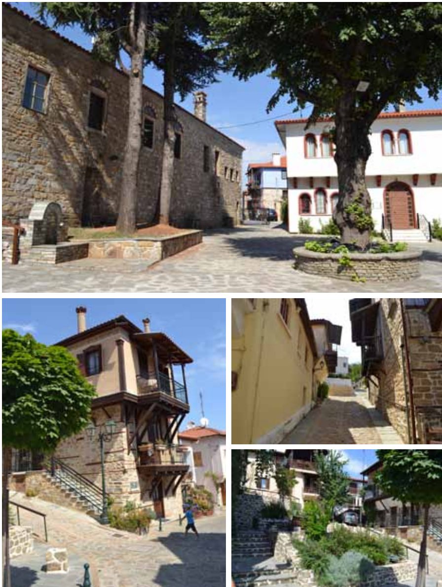
Figure 2. Public and semi-public spaces, pavement and greenery, 2017 (source: authors).

There is also a very old tree marking the location of cold water spring that offers refreshment for residents and travelers (Figure 1 bottom right). The local legend holds if a man drinks from it he will marry an Arnaia girl. The spring is located in the liveliest part of the village which serves as a meeting place for residents – especially on Sundays after worship in the nearby church of St. Stefano. The Church, built in 1821, has repeatedly perished in the fires only to be rebuilt. During its renewal it was determined that it lies on the foundations of a much older Christian temple from the 4-5 Century and a Christian basilica from the 10-11 Century.