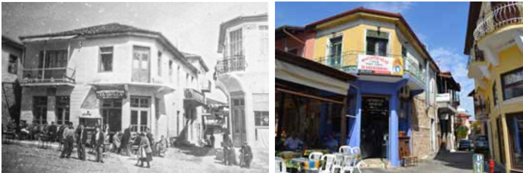
Figure 3. Buildings in Arnaia's main square, left – before the second World War, left and in 2017.