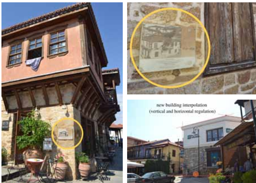
Figure 6. Highlighted circle shows an informative panel on facades of renovated buildings – the building’s date and original layout. Bottom right image shows it in context of new structures in the neighborhood.

Most buildings kept their original purpose, while one part changed to commercial use or home to cultural institutions to enhance offers, but to also encourage the active restoration of abandoned buildings (Hatzidakis, 1996). Renovated facilities in prominent locations have mounted on their facade an historical site plaque describing the original structure’s history, its owners and if available, an early photo. (Figure 6).