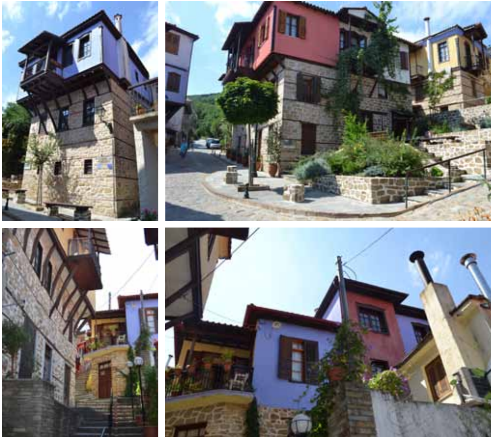
Figure 5. Typical Arnaia architecture, the use of natural materials and colors, 2017.

The architecture in this area is both sacred and profane as it is in the proximity of the Holy Mountain Athos, which is reflected in their form and decorative elements as well as the facade's colors