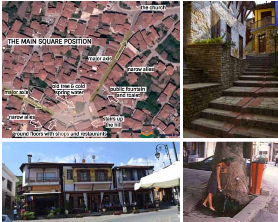
Figure 1. The town of Arnaia, an urban matrix and the locations of the most important public spaces. (source: http://gis.ktimanet.gr/wms/ktbasemap/default.aspx ), with photos and drawing by the authors.

of the streets inflow into the central square (Figure 1). It is also evident where problems with parking and access to individual buildings due to terrain are, but these could be rectified with centrally located parking spaces.