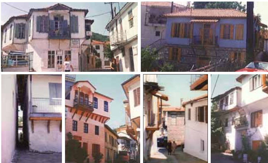
Figure 4. The beginning of the urban renewal period 1991-1996. Initially it began slowly and only on a few buildings and mostly involved facade work (balconies), but the improvements were evident.