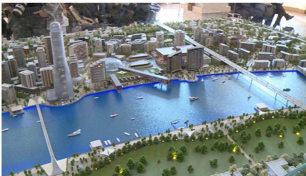
Figure 1: D model.