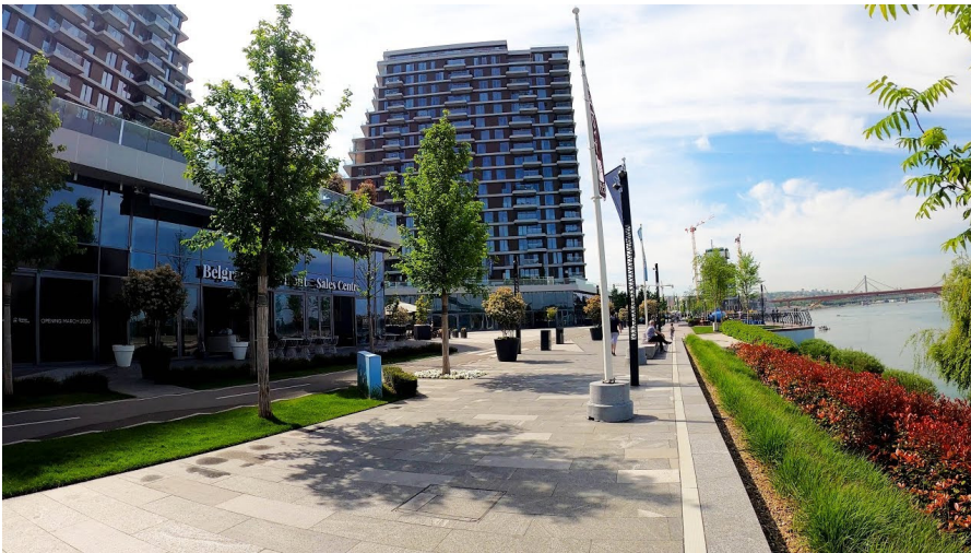
Figure 3: Promenade.

In the general division of land use, public land is presented as a 70% share and other (residential and commercial) uses as 30%. However, the border of the plan includes the water surface of the River Sava, greenery and planned streets on the opposite bank (Fig. 2). This means that percentage of public land in the planned development is not exactly as calculated, but much smaller. Besides the already-built residential blocks and shopping mall, with a skyscraper under construction, the only public use is the pedestrian promenade by the river with several playgrounds (Fig. 3). The position and urban design were not debatable, but it soon became a new gathering place for citizens, although the promenade is on a higher level above the river bank, in order to protect it from flooding. But other issues like the position, shape and height of the buildings and the blocked views of the city and its skyline, and the proposal to remove the old tram bridge across the Sava and build a new one, have once again raised protests by citizens' groups.