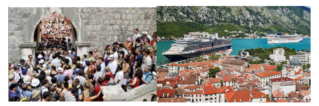
Figure 3. Dubrovnik (left) and Kotor (right).

It was concluded that joint actions lead to problem resolution, i.e., the cooperation between Dubrovnik and Kotor should be extended to other cities that are on cruise companies' itineraries to jointly participate in creating the schedule of cruise ship arrivals [139]. Organising the cities on the routes of cruise companies is necessary, harmonising the needs of the destinations with the needs of the tourist industry, because everything should be done to make cities tailored to the citizens [140]. However, from the citizen's point of view, a reduction in the size of the ships might be the only solution for overcrowding (based on the interviews).