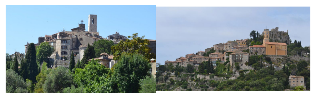
Figure 2. Saint Paul de Vence (left) and Èze (right).

These plans provided a satisfactory base to ensure the survival of historical places, allowing the expansion of the modern part of the settlement outside the fortress and implementing measures to preserve and conserve the historical entity by making an adequate change of purpose to maintain the vibrancy and function of the place. Tourism was represented as the most suitable commercial activity that would attract visitors and tenants and provide the economic prosperity needed to finance preservation while at the same time giving the impression of vitality, either in the form of accommodation capacities or the promotion of interesting concepts such as the art scene.