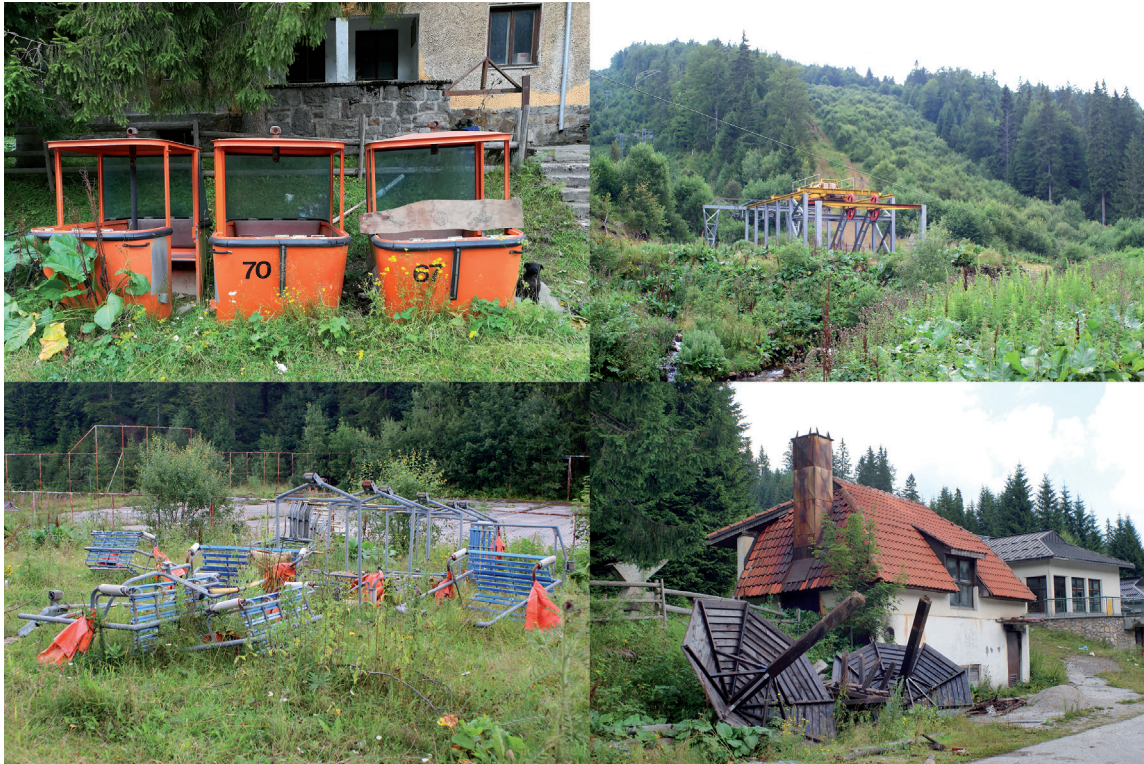
Figure 3 – Golijaska Reka ski resort – abandoned before it conformed to its designated use.

the capacity for development activities [...] but they recognize the economic interest of ski resorts because such projects enhance infrastructure development as well. The state financed the Odračnica-Ivanjica road, which provides us with access to the part of the municipality that was inaccessible before.” (Interview no. 18)