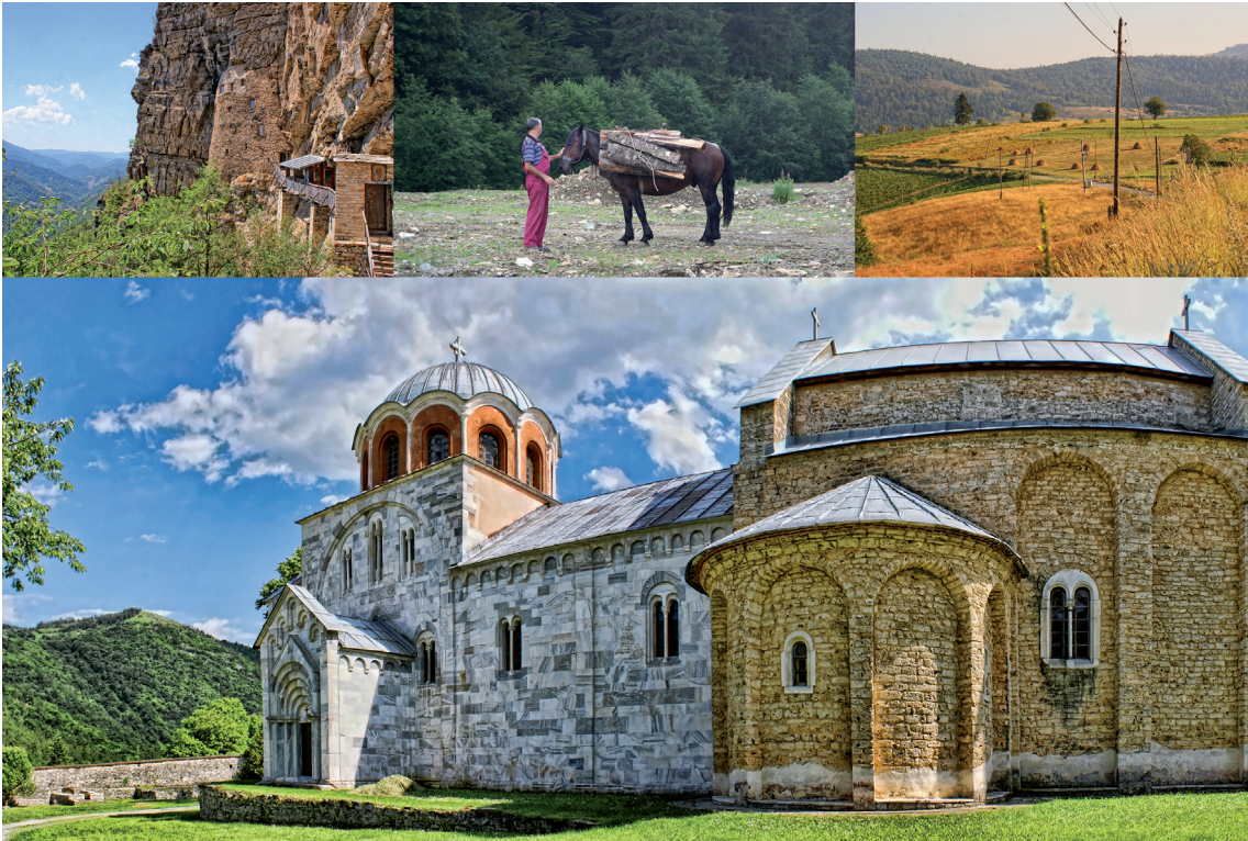
Figure 1 – Top: St. Sava's hermitage; hauling wood in Golijska Reka; Golijska landscape in Bzovik village; Bottom: Studenica Monastery.

simultaneously a learning practice that contributes to adaptive management (Hockings et al. 2006).