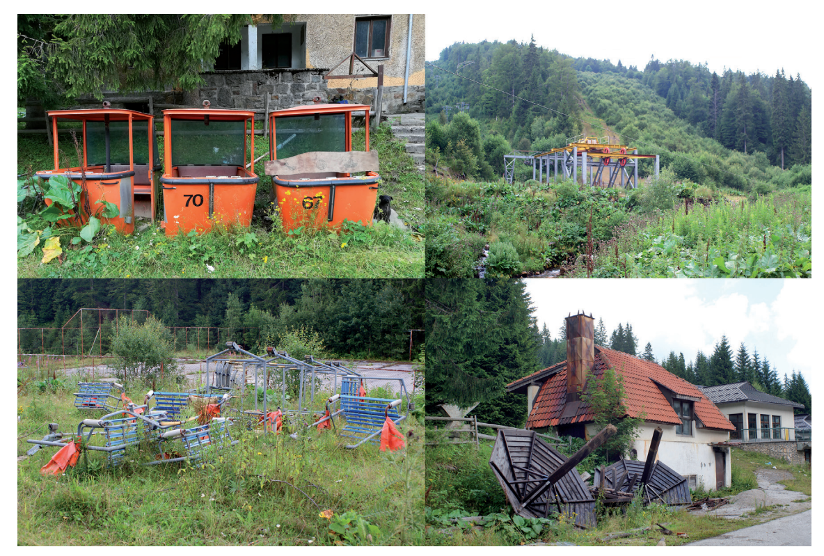
Figure 3 – Golijska Reka ski resort – abandoned before it conformed to its designated use.

the capacity for development activities [...] but they recognize the economic interest of ski resorts because such projects enhance infrastructure development as well. The state financed the Odvraćenica-Ivanjica road, which provides us with access to the part of the municipality that was inaccessible before." (Interview no. 18)