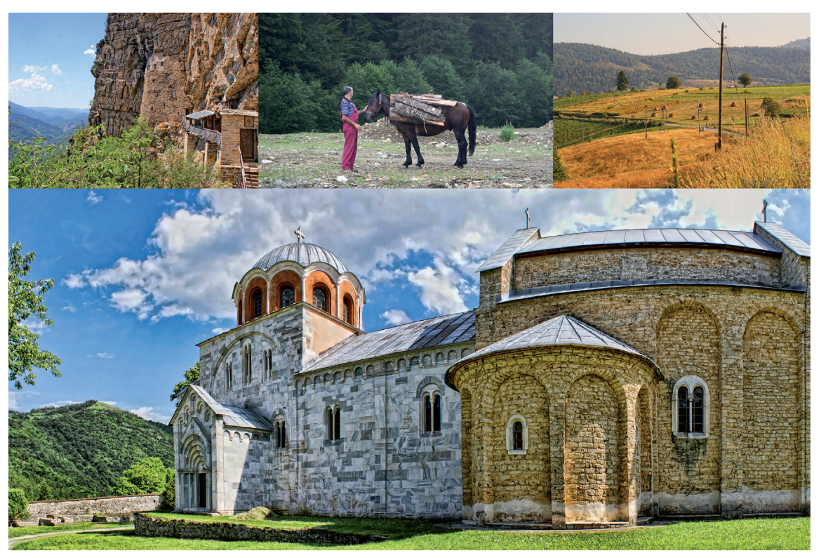
Figure 1 – Top: St. Sava's hermitage; hauling wood in Golijska Reka; Golija landscape in Bzovik village; Bottom: Studenica Monastery.

simultaneously a learning practice that contributes to adaptive management (Hockings et al. 2006).